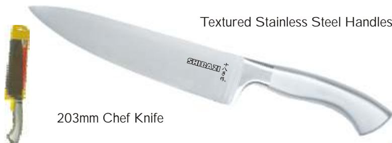
203mm Chef Knife