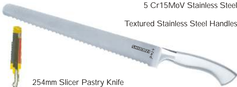
254mm Slicer Pastry Knife