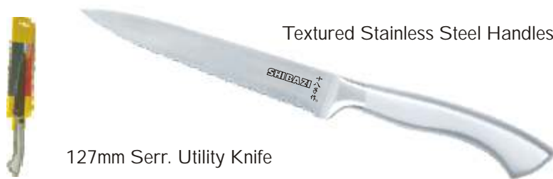
127mm Serr. Utility Knife