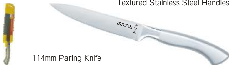
114mm Paring Knife